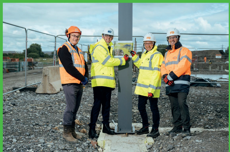
Members of Carmarthenshire County Council joined the Bouygues UK team to celebrate the commencement of the superstructure steel, a key milestone.

Habitat enhancement to edge of Dafen lake (October 2023 – March 2024)