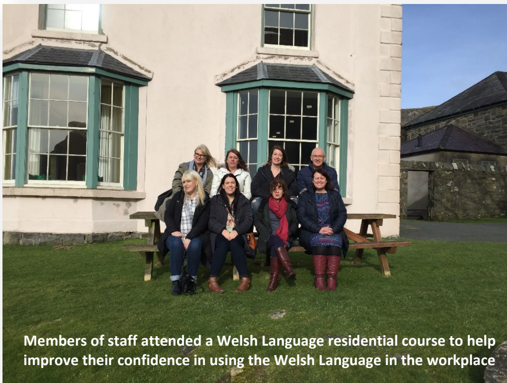
Members of staff attended a Welsh Language residential course to help improve their confidence in using the Welsh Language in the workplace