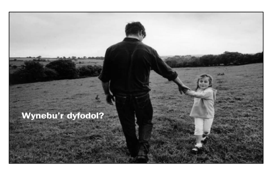
Facing the Future?