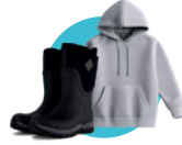
Spare warm clothes and sturdy boots