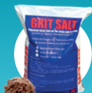
Small bag of grit or cat litter