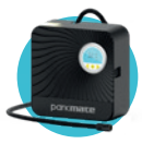
Tyre pressure gauge and pump