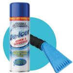
De-icer and ice scraper