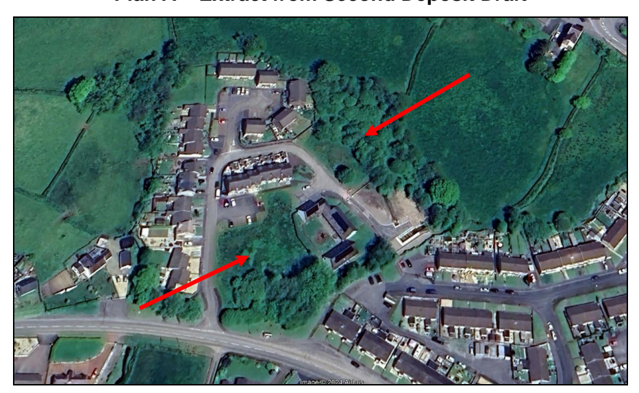
Photograph 1 - Google Earth - September 2023