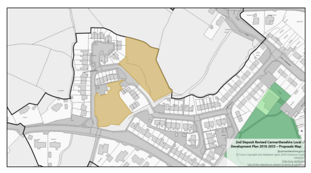
Plan A - Extract from Second Deposit Draft

2.1.1 Since the submission of our original objection to the allocation of the land for housing development purposes, the proposed allocation (Plan A) remains undeveloped, as illustrated by the aerial photograph below.