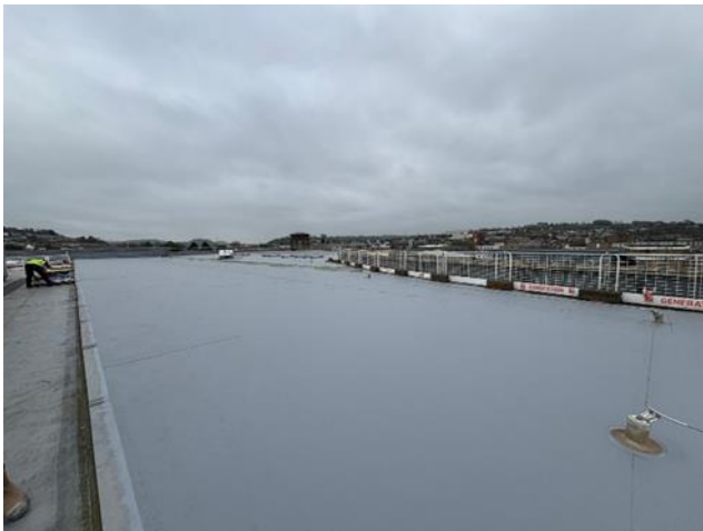
Roof being re-laid with single ply membrane

We were also happy to be given the opportunity to sponsor the St Catherines Walk Christmas tree in December which took pride of place just outside the main entrance to the market.