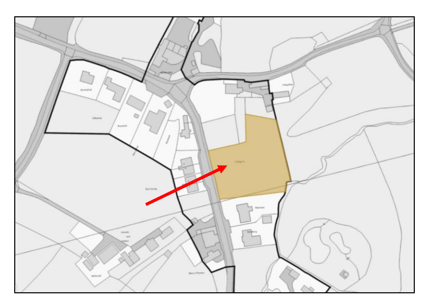
Plan A – Second Deposit Draft Map Extract

2.1.1 Since the submission of our original objection to the allocation of the land for housing development purposes, the proposed allocation (Plan A) remains undeveloped, as illustrated by the aerial photograph below.