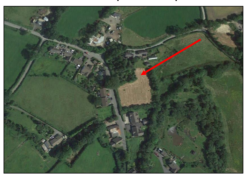
Photograph 1 - July 2021