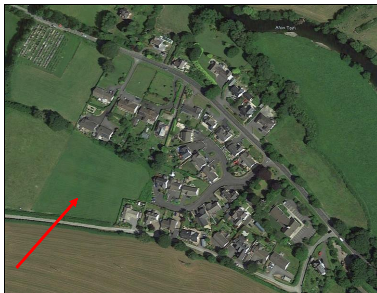
Photograph 1 – Google Earth – July 2021