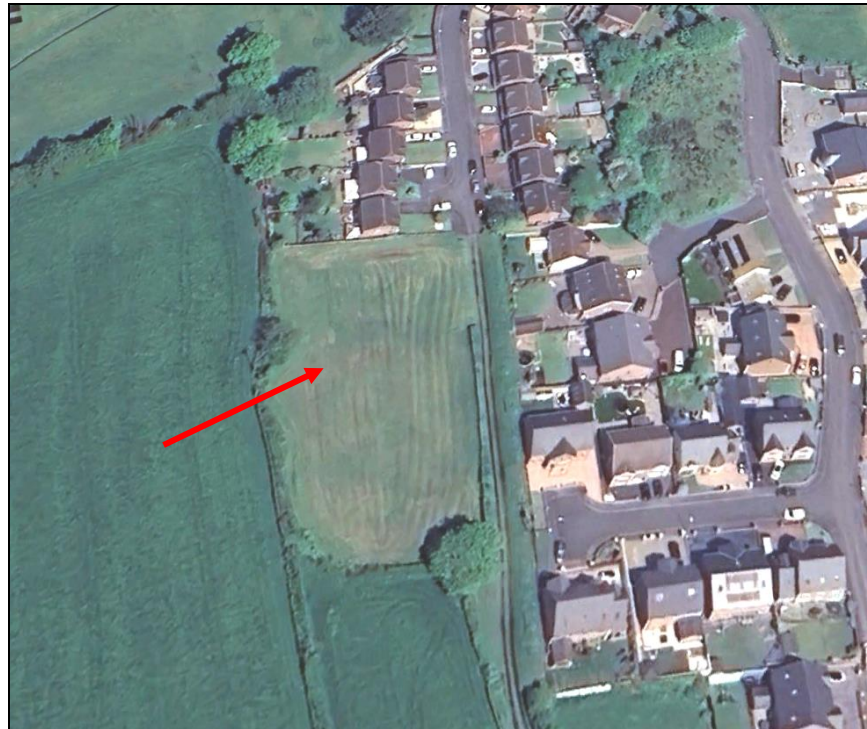
Photograph 1 – May 2023

2.1.2 The site presently and for some time been used for agricultural purposes only.